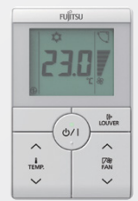
Simple Wired Controller (without Operation mode)* UTY-RHRYT

*Optional Communication Kit required for connection