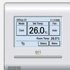
Wired Touch Controller* UTY-RNRYS5