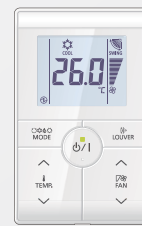
Simple Wired Controller* UTY-RSRYT