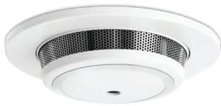
CAVIUS WIRELESS FAMILY 10 YEAR PHOTOELECTRIC SMOKE ALARM PRODUCT CODE: 2107 CAV10WF