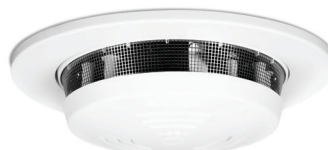
CAVIUS WIRELESS FAMILY MAINS POWERED PHOTOELECTRIC SMOKE ALARM PRODUCT CODE: 2203 CAVMP Recessed option shown