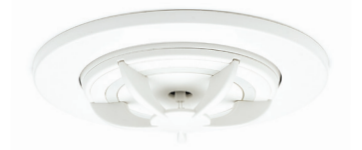
CAVIUS WIRELESS FAMILY 10 YEAR HEAT ALARM PRODUCT CODE: 3107 CAVTH10WF