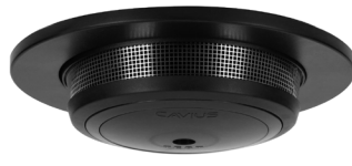
CAVIUS WIRELESS FAMILY 10 YEAR PHOTOELECTRIC SMOKE ALARM - BLACK PRODUCT CODE: 2117 CAV10WFBK